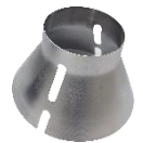
FLOW CONTROL WEIR