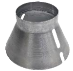
FLOW CONTROL WEIR